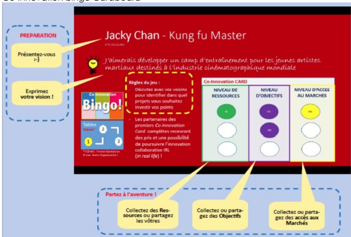
Figure 1 Co-Innovation bingo Cardboard

Participants are invited to discuss with their neighbours to identify in which project they could invest points. They can invest game points in the projects they want, and get points regarding resources, markets, and vision to create a consortium. The goal is to totalize 9 points: 3 resources, 3 market accesses and 3 visions. The low amount of points assures simplicity and quick wins. Figure 1 below shows the Bingo cardboard.