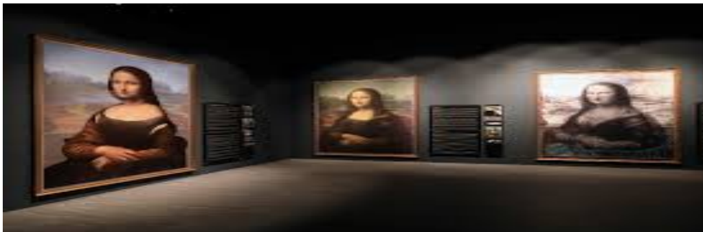
Figure 3 World Exhibition "500 Years of Genius"

The exhibition gave the whole view of Leonardo da Vinci's work, life and thoughts. The first room presented Leonardo's machine works. The second room presented Leonardo's medical research on the human body. The third room presented different views on Leonardo's most famous painting "Mona Lisa". Families with children, young people, middle-aged people and retired people were the visitors. They enjoyed the look at Leonardo's paintings. A special room presented Leonardo's painting "The Last Supper". In the middle of the exhibition was a room that presented the artist's multimedia work, with his philosophical thoughts, such as "Nothing can be loved or hated unless it is first understood", "In time and with water, everything changes", "Water is the driving force in nature". Comments on social media was that exhibition was brilliant as Leonardo da Vinci deserves. Especially young people were interested in his work, thoughts and life. Many young tourists come to London, Paris, Rome and Athens. The whole exhibition was a sophisticate, and, also, strong experience, according to visitors comments, is what inspired tourists around the world to come and visit the exhibition.