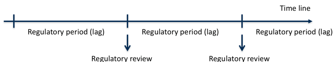
Figure 1: The regulation timeline.

We deal with OPEX-risk in the context of monopoly regulation of revenues or profits. In the debate on a CAPEX-bias in the regulated water industry in the UK, ECA (2011, p. 2) notes: “the main sources of systematic risk are likely to be in OPEX markets and in periodic review processes.” The classical distinction in regulation is between cost-pass-through and price-based regulation. The most prominent example of the former is rate-of-return regulation and examples of the latter are RPI-X, price-cap and revenue-cap regulation (cf. Beesley and Littlechild, 1989; Sappington and Weisman, 2010). They have two important aspects in common: first, the regulatory lag within a regulatory period and second, the regulatory review. Figure 1 illustrates the regulation timeline.