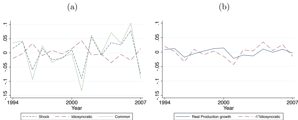
Figure 2: Decomposed Time Series Growth Rates

Note: Shock is the weighted sum of productivity growth, idiosyncratic is the weighted sum of idiosyncratic productivity growth, and common is the weighted sum of common productivity growth. (a) shows the series and (b) plots the negative of the idiosyncratic series together with real production growth.