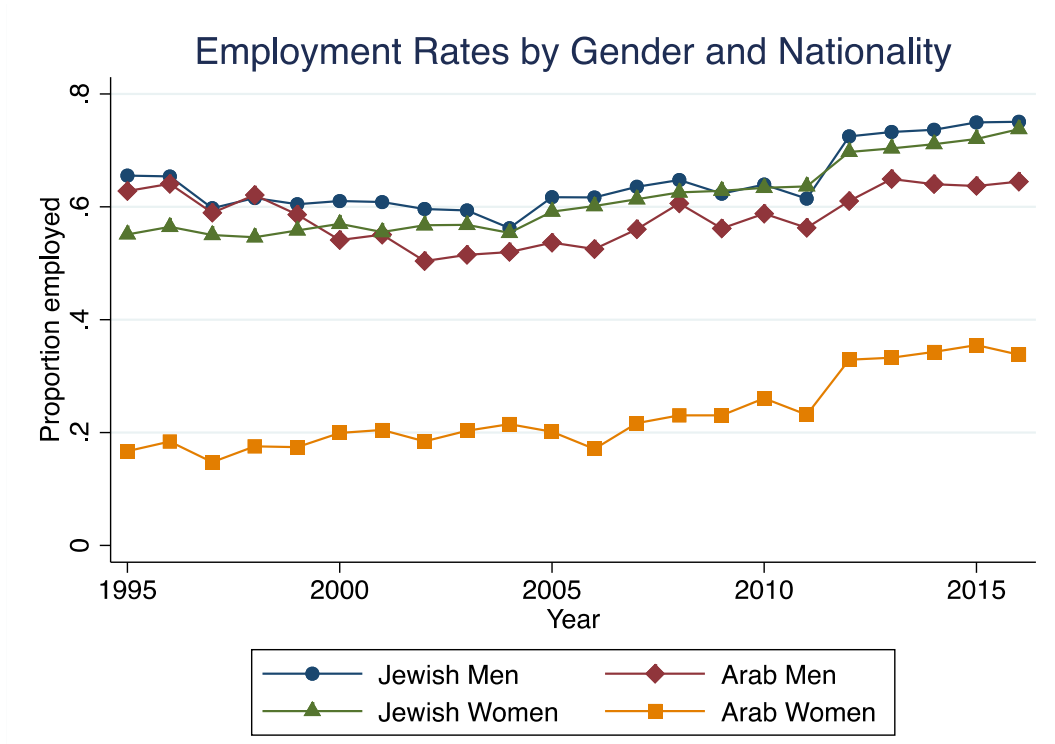
Figure 1: Employment rate, by gender and ethnic nationality, 1995-2016

Source: Authors' calculation based on Israeli Labour Force Survey, 1995-2016. Notes: Sample does not include Arabs from East Jerusalem and the Golan Heights. The data relate to the major segment of the labour force – persons aged 15 to 64.