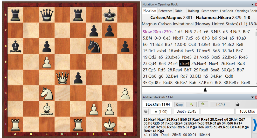
(b) Engine evaluation after move