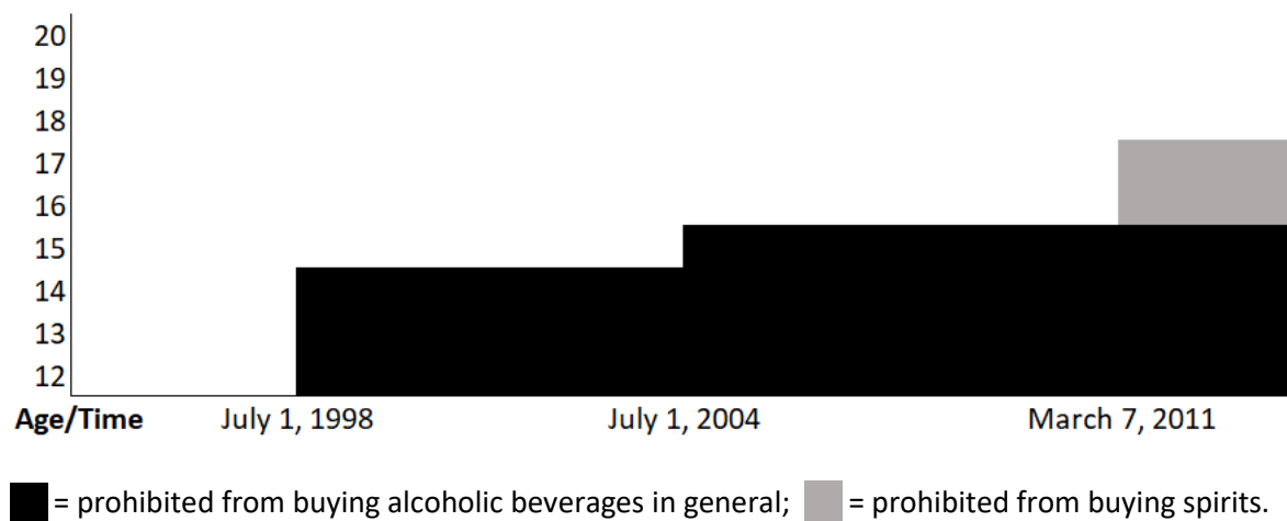
Figure 1: Illustration of the reforms.