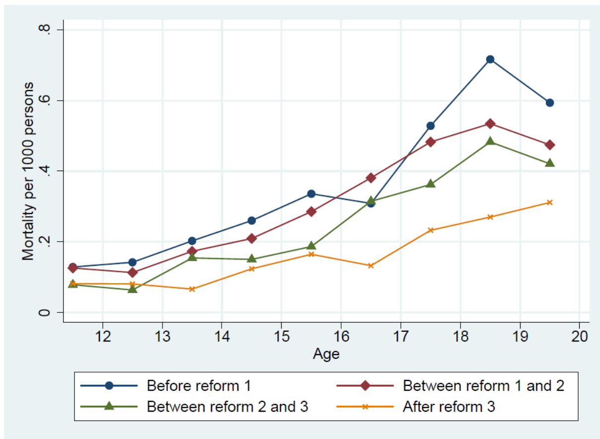
Figure A2: Deaths per 1,000 persons and year in different policy periods. “Before reform 1” represents 1995–1997, “between reform 1 and 2” 1999–2002, “between reform 2 and 3” 2005–2010, and “after reform 3” 2012–2013.