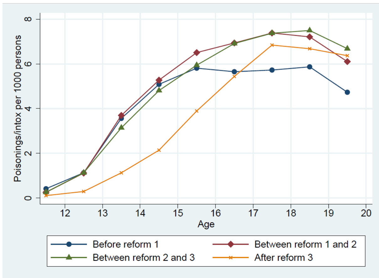
Figure A1: Alcohol poisonings and intoxications per 1,000 persons and year in different policy periods. “Before reform 1” represents 1995–1997, “between reform 1 and 2” 1999–2002, “between reform 2 and 3” 2005–2010, and “after reform 3” 2012–2013.