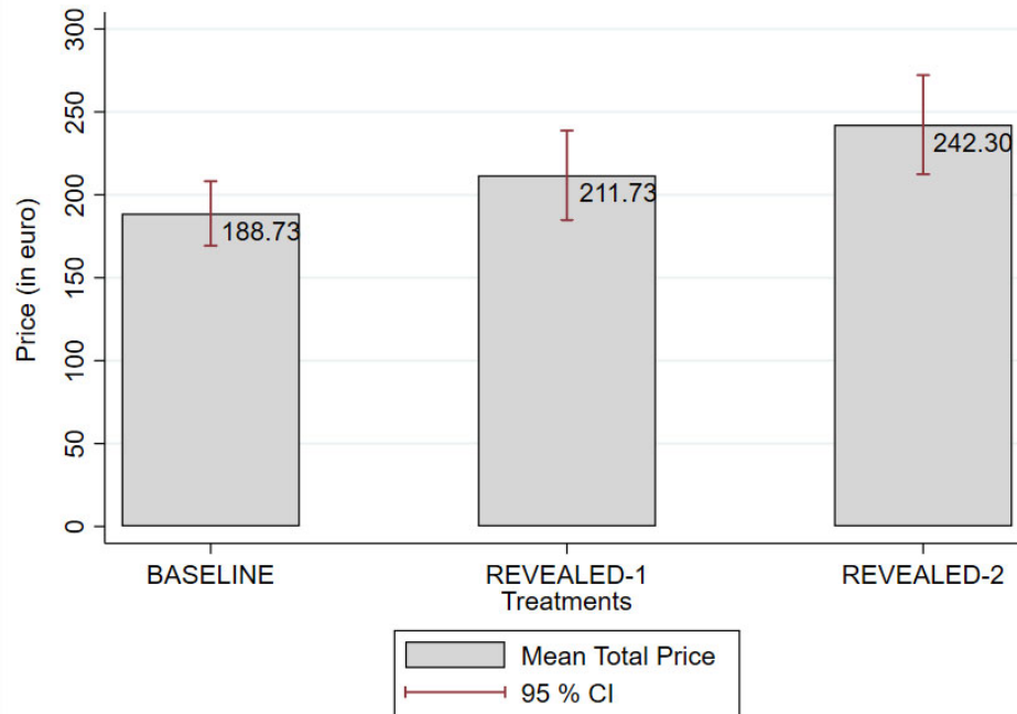
Figure 2: Average repair price conditional on the repair being successful

Notes: Average repair price per treatment in case of a successful repair (N=25 in BASELINE, 23 in the REVEALED-1 treatment, and 27 in the REVEALED-2 treatment, respectively). Average price (in euro) indicated in the top right corner of each bar. Error bars, mean \pm SEM.