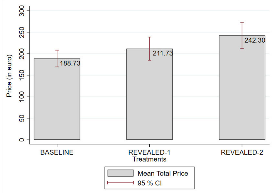
Figure 2: Average repair price conditional on the repair being successful

Notes: Average repair price per treatment in case of a successful repair (N=25 in BASELINE, 23 in the REVEALED-1 treatment, and 27 in the REVEALED-2 treatment, respectively). Average price (in euro) indicated in the top right corner of each bar. Error bars, mean \pm SEM.