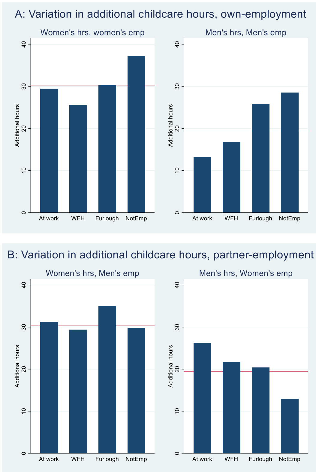
Figure 1: Additional hours' childcare (total per week), by post-COVID19 employment status

Notes to table: The figure shows average self-reported total hours additional childcare done by men and women post-COVID19. For further information on questions asked, see Section 2.