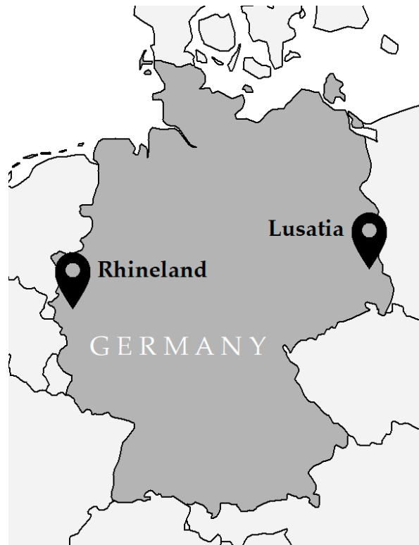
Figure 1. Location of the study regions Rhineland and Lusatia.

a fixed end-date. Its recommendation of phasing out coal by 2035–2038 [10] is a compromise between claims to phase out coal by 2030 to meet the Paris Agreement [11] and concerns of representatives of the lignite regions asking for sufficient time to manage the structural change. As of September 2019, the recommendations of the commission are currently being transferred and specified in the so-called Structural Enhancement Act (Strukturstärkungsgesetz), to be passed by the end of 2019.