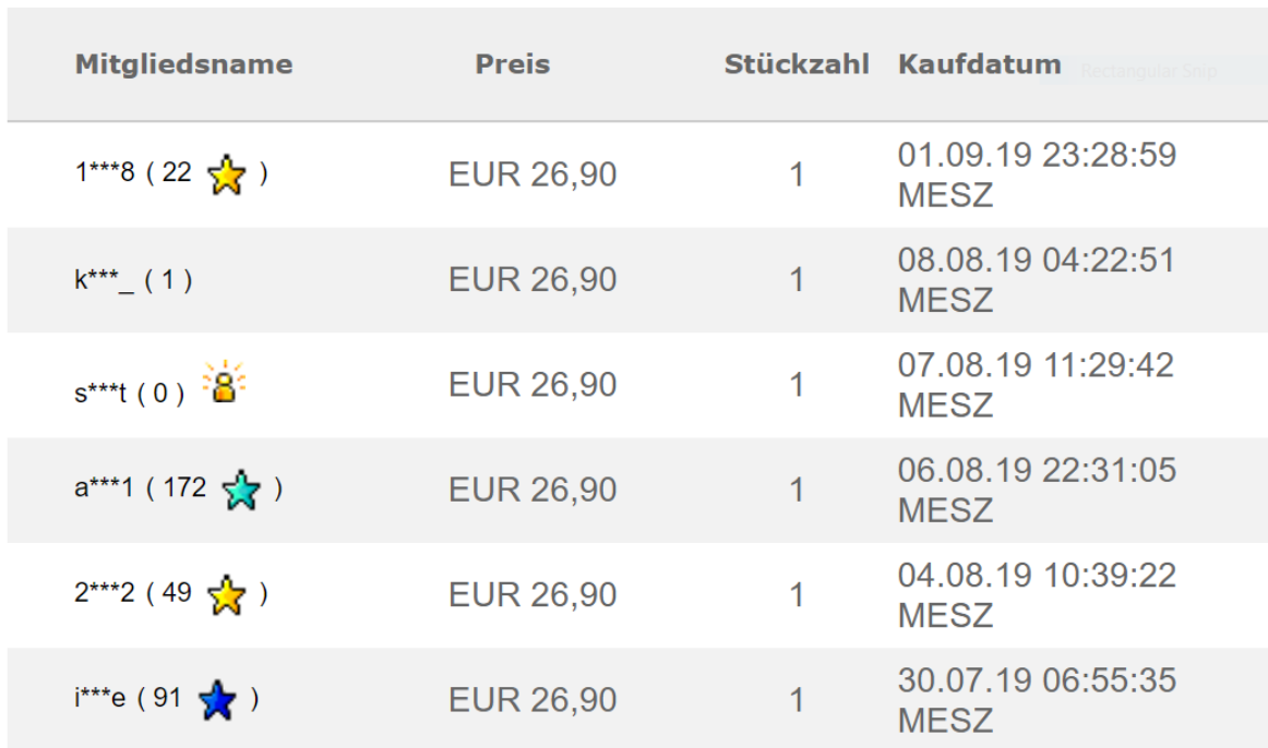
Figure 4: The list of past transactions for a listing on eBay Germany