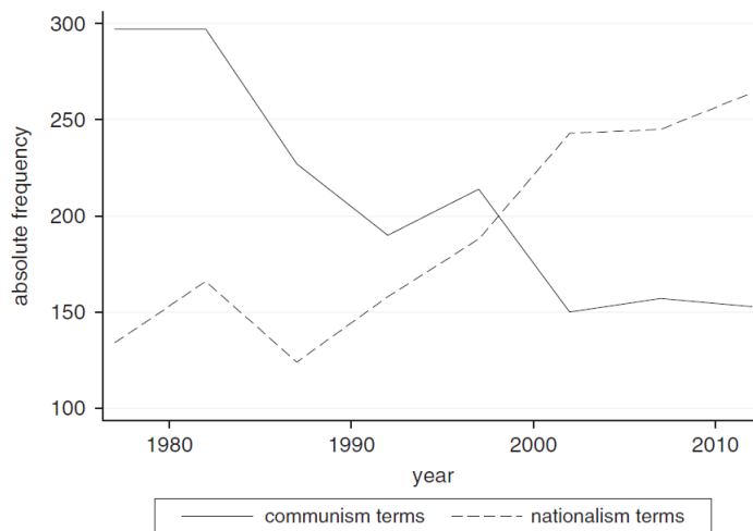
Figure 3. Frequency of Terms: Communism and Nationalism in China

for the last 30 years. In China the relationship between the two core concepts of the ideological ‘macroscopic structural arrangement’ (Freeden 1994: 141) of national communism has been almost completely reversed. It has adapted to changing circumstances and has fundamentally changed the composition of its ideological discourse.