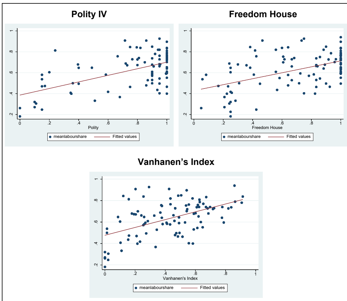
Figure 1: Bivariate Scatters: Democracy and the Labor Share, 2005–2014