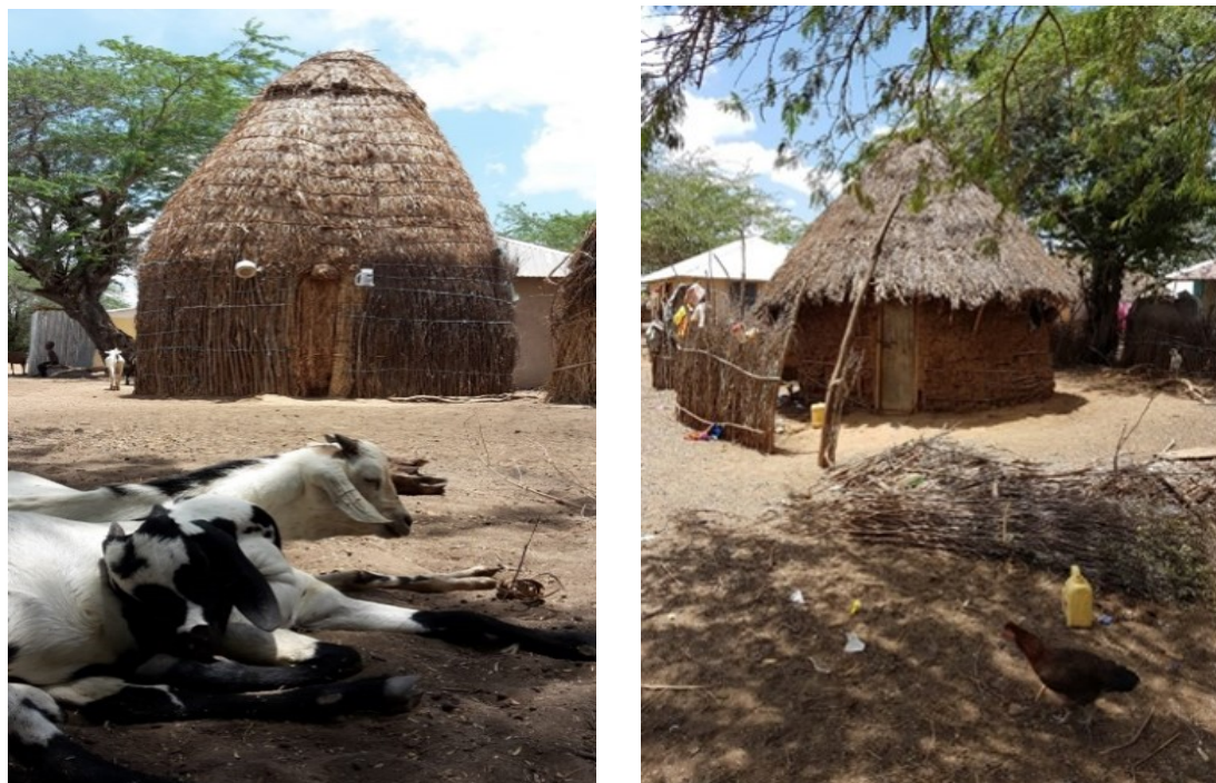
Figure 2: Houses in the Orma village Dumu B

Notes: On the left: houses constructed the usual way; on the right: houses built for newlyweds only.