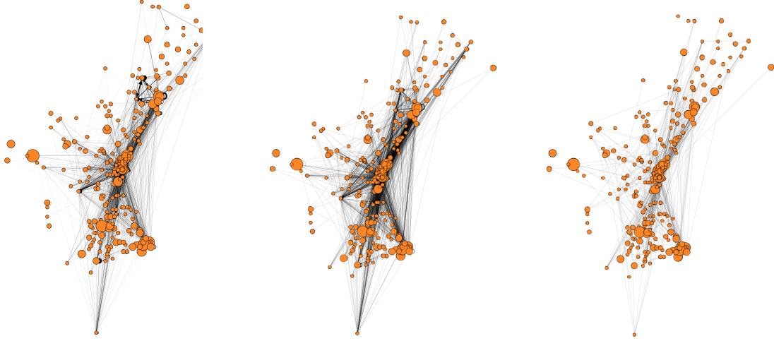
Figure 2: Production network of the autonomous region “Comunidad Valenciana.” – direct and indirect connections. We aggregate firms on the zip-code level. The size of a node is proportional to the aggregate sales of all firms in the same zip-code location. The thickness of a link is proportional to the value associated to that link. For visibility we keep only links that are in the 90th percentile with respect to their value. The links in the leftmost figure indicate direct connections. The links in the middle network represent indirect connections of length 2 (the network whose adjacency matrix is \mathbf{G}^2 ). The links in the rightmost figure indicate that two nodes are not directly connected but are indirectly connected through a path of length 2. The layout is based on the geographical coordinates of the corresponding zip-code areas.