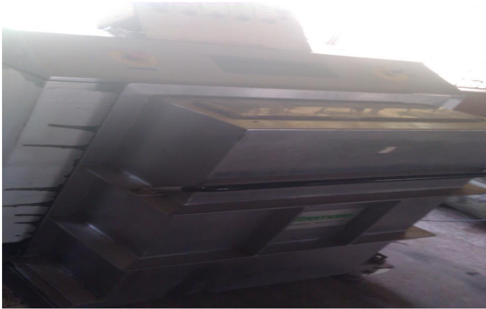
plate 6: The Oltremare nut sealing machine