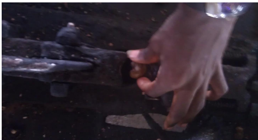
Plate 4: The cutter showing the nut cutting style

adopting the mechanical method of cutting is because of the irregular shape of the nuts. The whole kernels are then collected on the other side of the cutter and weighed.