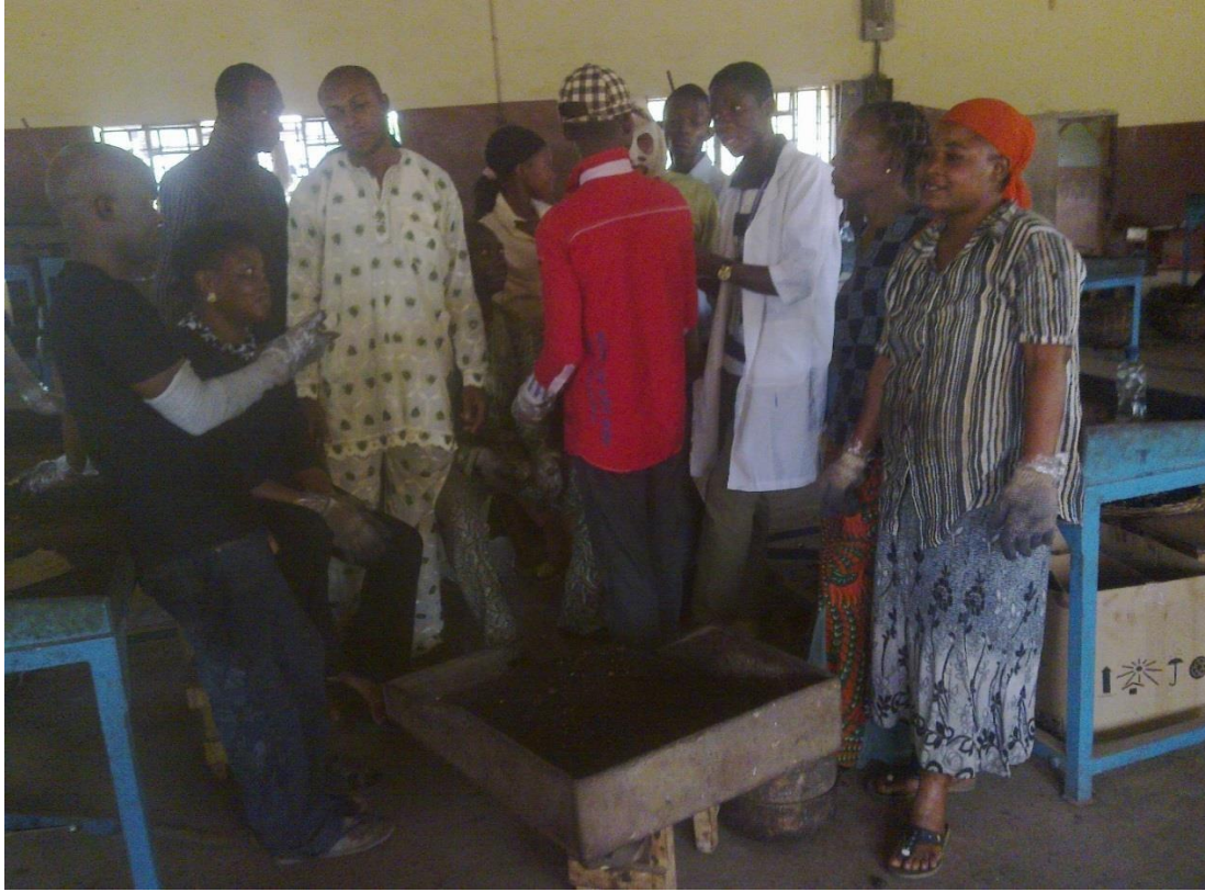
Plate 8: Data collection from the 14 ‘key’ workers on production Dynamics of the processing industry, using Focus Group Discussion