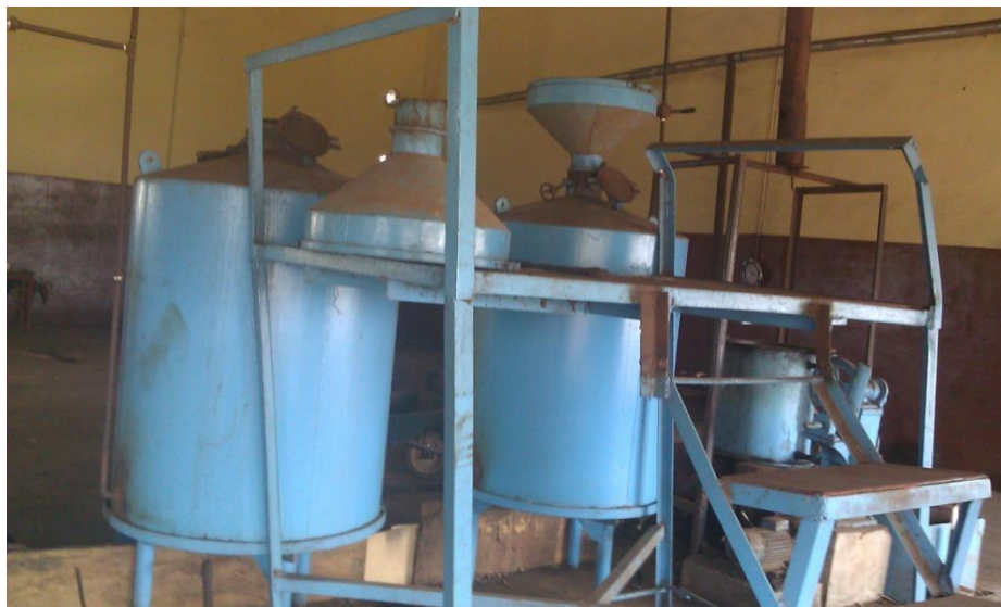
Plate 1: The cashew boiling container

The raw cashew nuts after sun dried are poured to the boiling container. The steam engine attached to the boiling container is rolled to supply steam at 150 0 c to the container to pre-cook the nuts. The reason for pre-cooking is to reduce the acidic content of the cashew nut. The nuts are then roasted with a manually supplied fire with wood to shrink the whole for easy removal of the kernel. The nuts are then spread under shade to dry for a minimum of 8 hours.