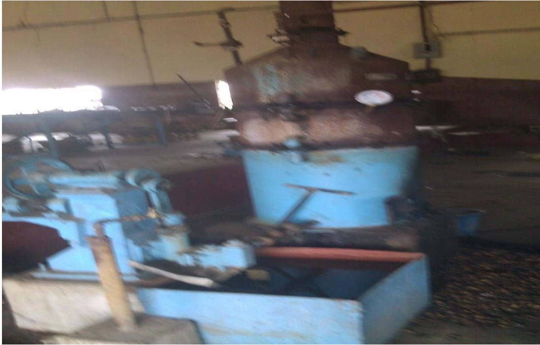
Plate2: The steam Engine used to supply boiling gas