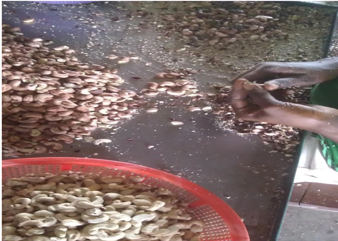
Plate 5: Removal of the testa from the kernel

The testa is stylishly removed from the kernel manually with knife as shown below;