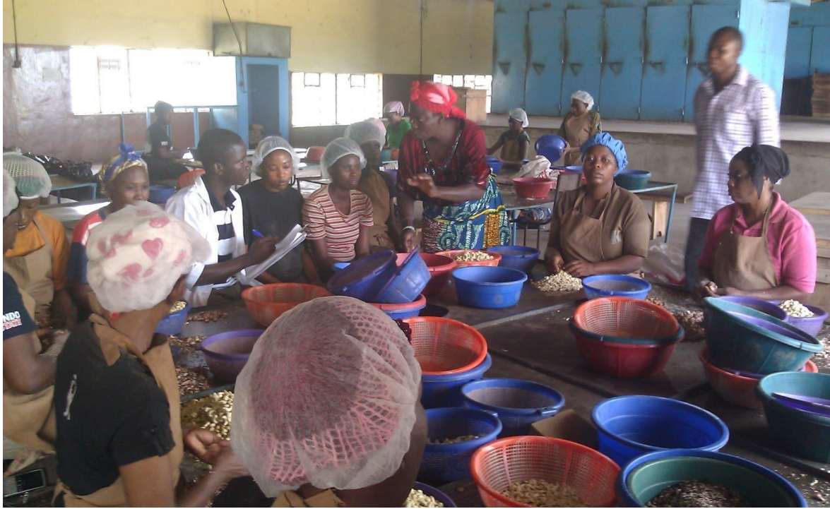
Plate 7: Data collection on the opinions/problems facing the workers, using Focus Group Discussion