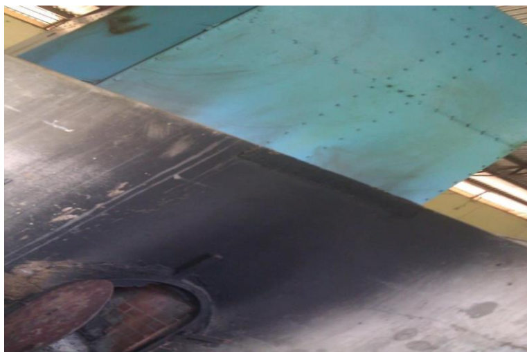
Plate 3: The fire roasting of the nuts