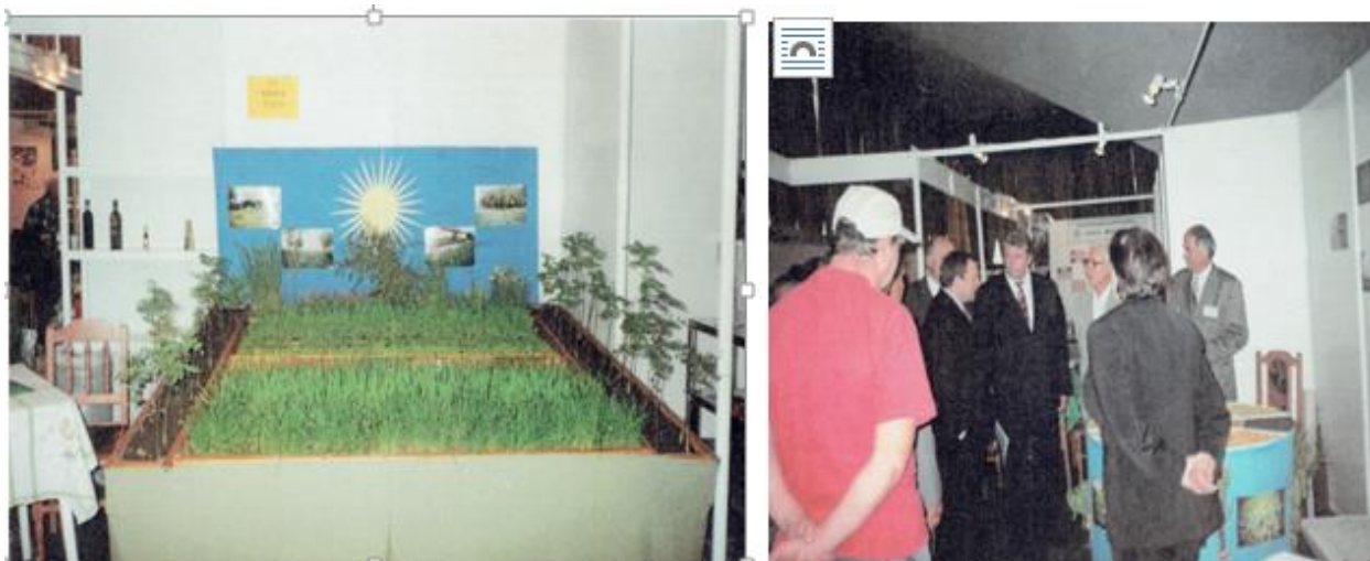
Fig.3 Exhibition of STEPA farm (above) and the visit of the resort minister (below, second from the left). (Source 4)

Annual forages. Winter fodder. Regularly is sown oats + vetch, which is harvested in May. It prepares the soil by not deep plowing, and harrows discs and is sown with mustard as green manure.