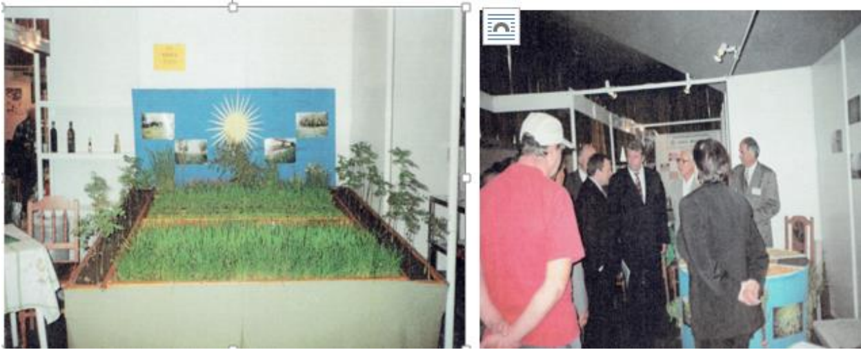
Fig.3 Exhibition of STEPA farm (above) and the visit of the resort minister (below, second from the left). (Source 4)

Annual forages. Winter fodder. Regularly is sown oats + vetch, which is harvested in May. It prepares the soil by not deep plowing, and harrows discs and is sown with mustard as green manure.