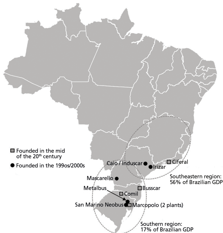
MAP 1 Bus bodywork manufacturers' location in Brazil