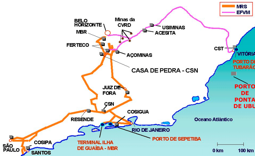
FIGURE 1 Location of the mines, railways and ports involved in the relevant markets of the case

CVRD retained after privatization not only the mining assets, but, what is most valuable for the business, the exporting ports and the whole set of railways connecting its mines in the States of Minas Gerais (EFVM) and Pará (EFC) to those ports. Figure 1 enables the reader to locate the broad sets of mines, the railways and the ports involved in the case.