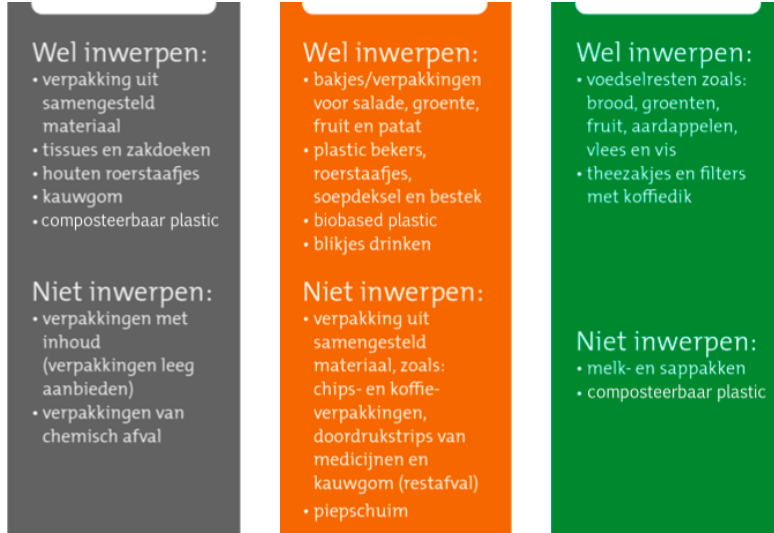
Figure 3: Additional information used in Biobased-I and Compostable-I to indicate the types of waste that should or should not be disposed of, customized for each trash can.

In Biobased-I and Compostable-I , we extended these icons with additional information on items that should or should not be disposed of, customized for each trash can. To make the information explicitly relevant to our experiment we adapted standard texts and added biobased and compostable plastics to these categories in three instances that we deemed most relevant based on the pilot experiment, see Figure 3. 6