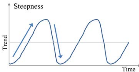
Figure 2. Steepness in business cycles

Steepness asymmetry is illustrated in Figure 2. The first difference of the cycle series would have the same graph as the graph in Figure 1(a). The null hypothesis in these tests is that a given distribution is symmetric about some unknown median, against a very broad class of asymmetric alternatives. More specifically, null hypothesis is that the business cycles have no deepness/steepness asymmetry against the alternative that cycles do have deepness/steepness asymmetry.