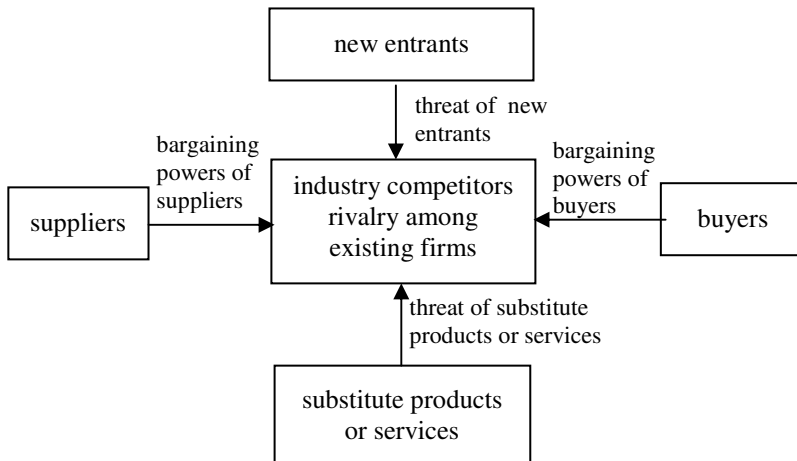
Figure 2. The five forces driving industry competition

Source: M.E. Porter, Competitive strategy. Techniques for Analyzing Industries and Competitors , The Free Press, New York 1980, p. 4.