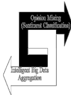
Figure 4: GiF Platform Fundamental Modules

Moreover, we are in the process of performing a patent search as regards entity extraction and sentiment analysis from Social Media and online publications. A freedom to operate (FTO) analysis will be conducted for all the targeted countries and it will be part of our proposed business plan. FTO is usually used to mean determining whether a particular action, such as testing or commercializing a product, can be done without infringing on valid intellectual property rights of others. With FTO we will ensure that our technology will not interfere with existing patents globally.