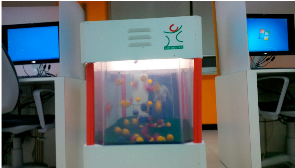
Figure A1. The Bingo Blower (photo taken in the CESARE experimental lab).