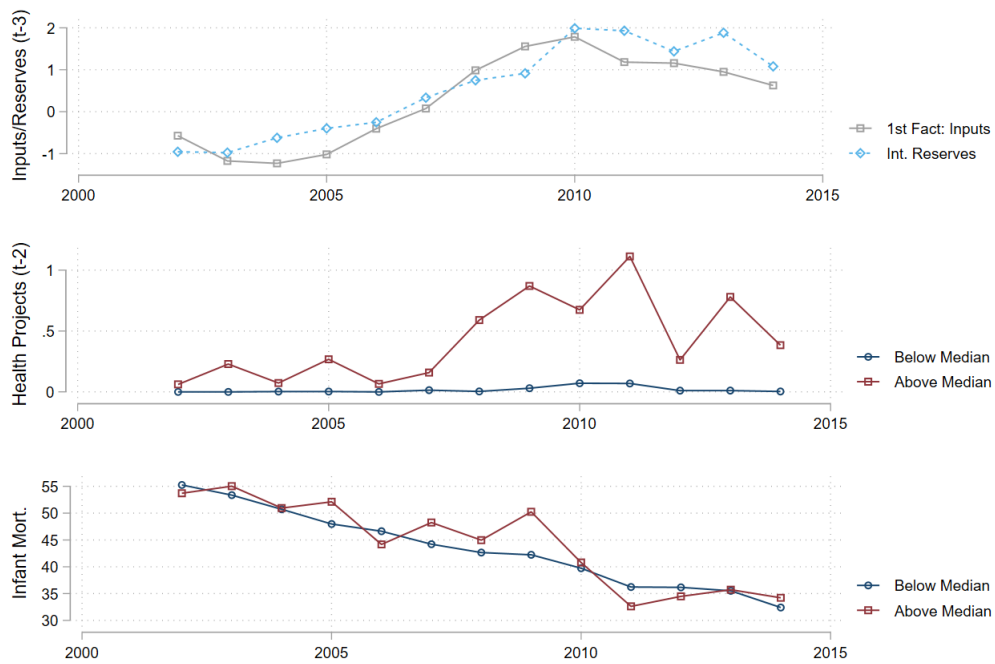
Figure 1 – Testing Spurious Trends: China

Notes: The first panel shows the first principal factor of China's (logged and detrended) production of aluminum (in 10,000 tons), cement (in 10,000 tons), glass (in 10,000 weight cases), iron (in 10,000 tons), steel (in 10,000 tons), and timber (in 10,000 cubic meters) over time. It also shows the (detrended) change in net foreign exchange reserves (in trillions of constant 2010 US dollars). The second panel shows the average number of Chinese health projects within the group that is below the median of the probability of receiving projects and the group that is above the median (conditional on receiving any project). The lower panel shows the infant mortality rate within these two groups.