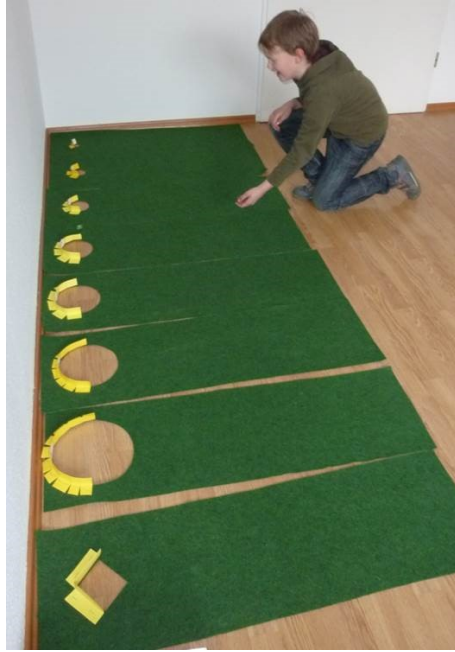
Figure A2: The marble lanes