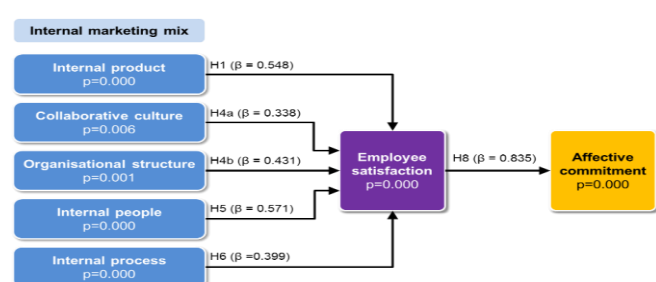
Figure 2: The final refined theoretical model proposed based on the overall regression results.

The results from the regression indicates a positive relationship between employee satisfaction and affective commitment and therefore support the hypothesis ( \beta = 0.835 , p < 0.05 ). The direction of the relationship was congruent with a priori theorising since a strong positive relationship was found between employee satisfaction and affective commitment. The null hypothesis can therefore be rejected in favour of the alternative hypothesis. The adjusted R^2 value of 0.693 indicates that approximately 69.3% of the variance in affective commitment is predicted by employee satisfaction. A significantly positive relationship between employee satisfaction and affective commitment proves to exist, indicating that H8 can be accepted. Bailey, Albassami and Al-Meshal (2016) concur with the finding stating that a well developed and managed internal marketing strategy has a positive influence on the attitudes of employees, resulting in increased job satisfaction and employee commitment.