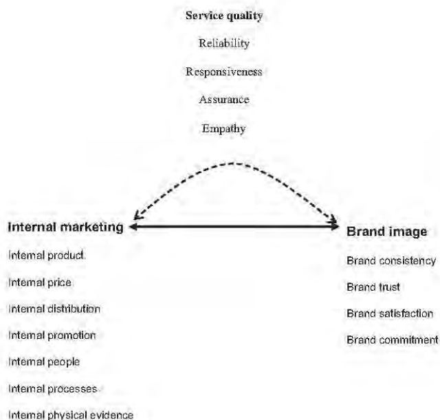
Figure 1: A framework of the three key relationships explored in the study

agencies amongst their clients. Figure 1 provides an illustration of the three key relationships in the study.