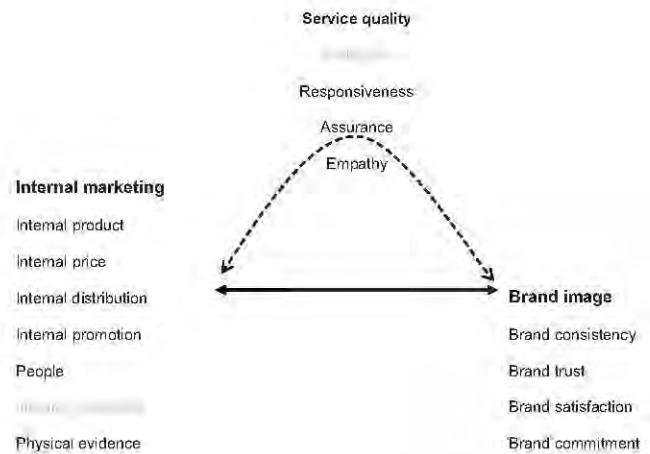
Figure 2: Proposed final statistical model

rejected. Considering the results, the following final model was therefore proposed.