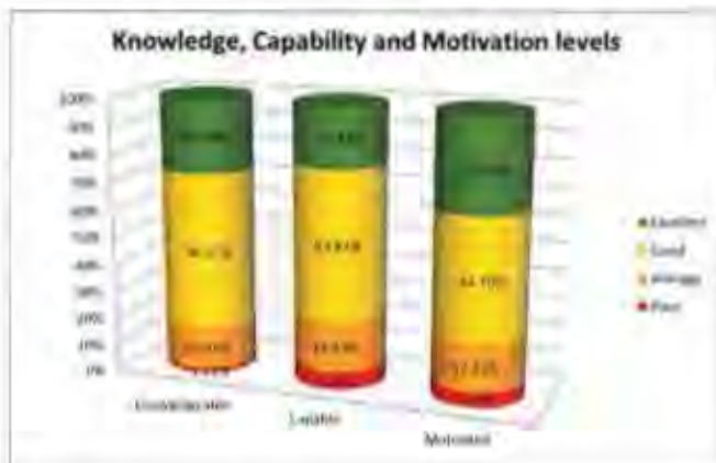
Figure 3: Categorized performance

The analysis of the responses in these different criteria is shown in Figure 3. More users (33.4% as opposed to 21.4% and 26.6%) are classified as being well-motivated using the defined bins. However, it is evident from Table 1 that there is a higher variance in Motivation ( \sigma = 0.152 ) than either Knowledge or Capability. A higher variation could indicate a potential to (positively) influence the Motivation to behave securely.