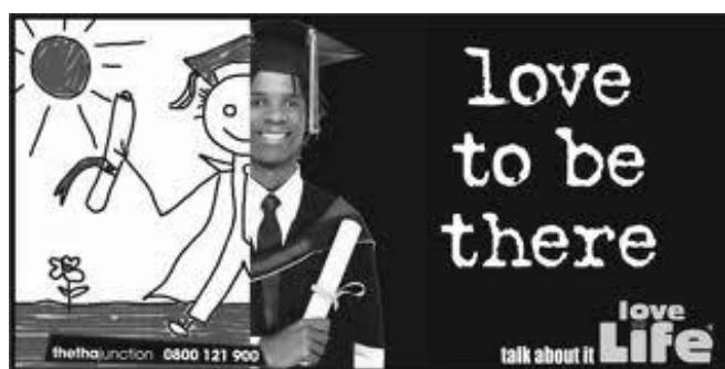
Figure 1: Typical loveLife advertisement

campaigns should ultimately influence the behavioural intent of individuals toward whom prevention campaigns are aimed (Shimp, 2010; Govender, 2009). It seems that standardized messages do not seem to be producing the expected results, especially within specific market segments like the young-adult market (Peng, 2006, Witte, 1998). A number of previous fear appeal study models (Arthur & Quester, 2004; Witte, 1992, 1994) were aimed at clarifying the role of fear in establishing the effectiveness of advertising. These studies also examined the moderating role of coping appraisal (i.e., “How possible is it for me to act this way?”) in determining consumer response. These studies also assessed perceptions of severity, susceptibility, response efficacy and self-efficacy as related to the fear appeal.