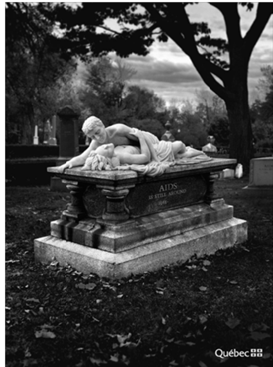
Figure 4: High fear print advertisement

groups who had access to television and print media and advertising. The final sample of 360 respondents included an equal male and female split, with 120 respondents per racial group, namely black, white and coloured.