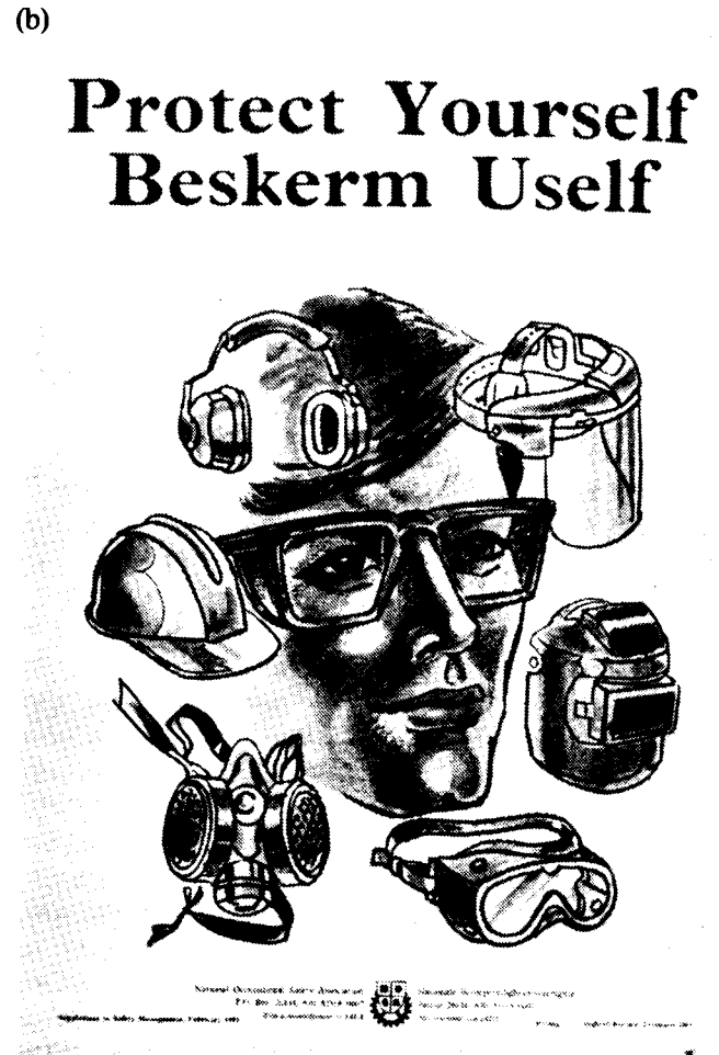
Figure 1 Showing two examples of existing (NOSA) safety posters: (a) The need to protect eyesight, (b) General protective equipment use