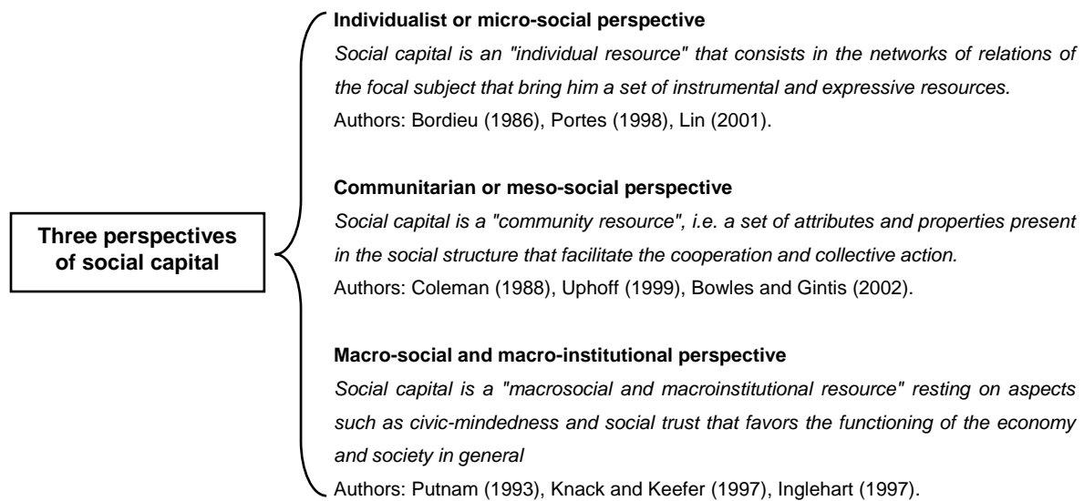
Figure 2. The three perspectives of social capital.

This division into three approaches corresponds to the triple cataloging of social capital as "individual good", as "collective good" and as "public good" (Putnam, 1993, 2000; Adler and Kwon, 2002, p. 22; Dasgupta, 2005; Sánchez-Santos and Pena-López, 2005). That is, social capital generates returns for the individual, for the group and for the whole of society.