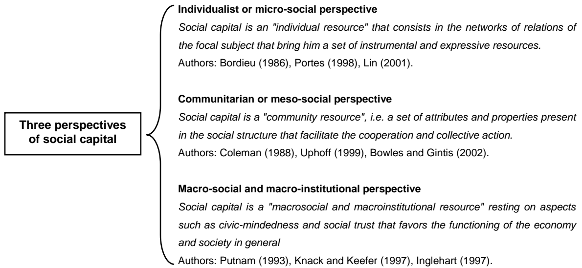
Figure 2. The three perspectives of social capital.

This division into three approaches corresponds to the triple cataloging of social capital as "individual good", as "collective good" and as "public good" (Putnam, 1993, 2000; Adler and Kwon, 2002, p. 22; Dasgupta, 2005; Sánchez-Santos and Pena-López, 2005). That is, social capital generates returns for the individual, for the group and for the whole of society.