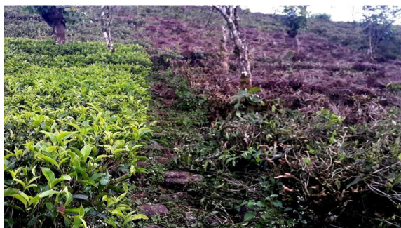
Fig. 2 Periodic pruning of commercial tea. The right hand side of the picture shows how pruning causes a sudden loss of bush-canopy in tea gardens

control and other agricultural inputs such as fertilizer, pest and disease control, etc. (Yamada et al. 2009).