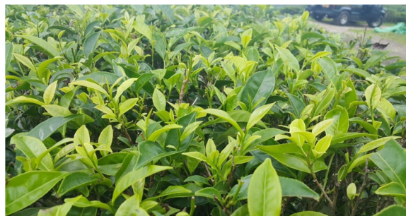
Fig. 1 Tea bushes subjected to hedge-row-effect over time. Due to this hedge-row-effect, the formation of clustered tiny shoots causes difficulty in harvesting