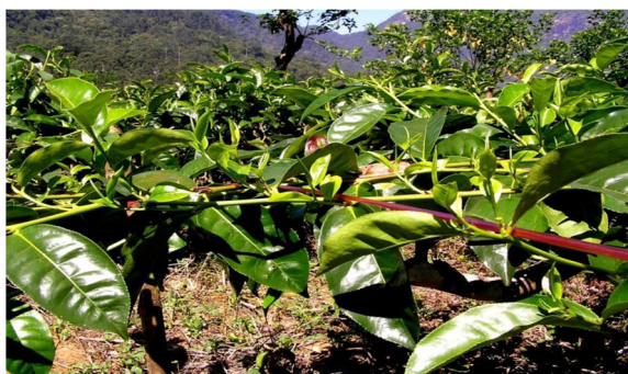
Fig. 4 Initiation of SSTB Method @120–140 days from pruning

Recovering tea bushes after pruning were allowed to grow up to 120 days and then, a radial spread of shoots was done using tight parallel stripes arranged along the tea rows instead of tipping in the treatment plots, while practising conventional tipping in the control plots declared adjoining them with the same cultivar of tea (refer Fig. 6). Both experimental and control plots were treated alike with all other agricultural practices. Data was collected methodically at regular intervals, but for the purpose of analysis they are presented for periods of 4, 6, 10 and 14 months.