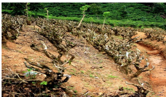
Fig. 3 Tea fields 3 weeks after pruning. Generally, pruned branches are removed and thorough weeding is done after pruning. This causes complete exposure of the ground to natural forces

Generally, pruned tea bushes are ready for the first harvest by 90 days from pruning if the growing conditions are favourable. Conventionally, the tea bushes are grown to a level parallel to the ground at the first harvest itself forming a plucking table. This eco-