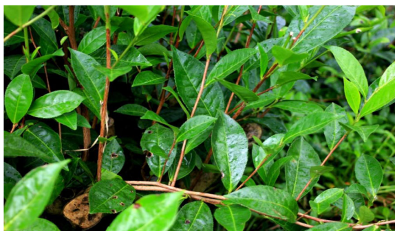
Fig. 5 SSTB @ 160–180 days. SSTB quickly allows developing a greater bush canopy cover

The same workers were employed in both treatment and control plots. Instruments such as weighing scales and spray tanks used for foliar spraying were regularly calibrated. The measurements and records maintained by the plantation company were regularly audited by internal, external and statutory audit teams independently after verifying and confirming all estate records.