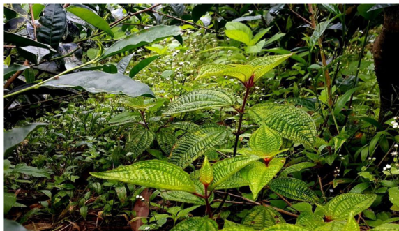
Fig. 7 Ground beneath at 08 months from pruning under control plots. The weed growth on exposed ground on tea inter-rows is in the range of 1000–1450 weed plants per m 2 . This, in turn, propagates chemical tolerant harmful weeds for tea

The use of core environmental measures such as energy, water or waste is not relevant to this study. Hence, the authors had to search for supplemental measures. The environmental perspective of the eco-innovation was therefore assessed through physical EMA information by using the canopy area and ground cover (refer Table 2). Instead of quantifying