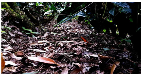
Fig. 8 Ground beneath at 08 months from pruning under treatment plots. The canopy cover of a tea bush is well developed optimizing resource usage while minimizing the growth of weeds

carbon storage parameters the canopy area of a bush and ground cover were taken here since they are directly and broadly linked with resource use efficiency and productivity in real terms in applied agriculture. It also offers a more manageable measure to start with when compared with complex carbon storage indicators. These selected measures provide additional plant biomass while absorbing the atmospheric CO 2 emissions, representing a reduction in a factor contributing to climate change (Harris 1992).