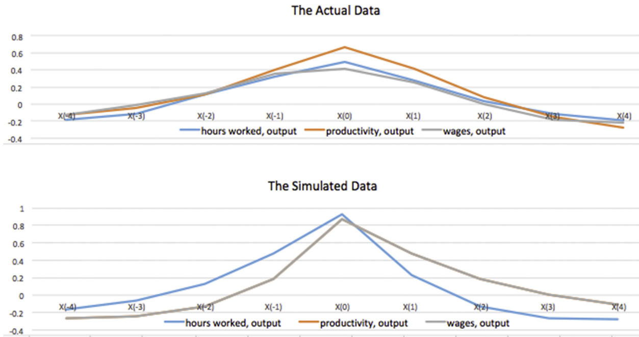
Fig. 1. Contemporaneous, lead and lag correlation coefficients between labour market variables and output.

model on the labour market. From the set-up of the model we know that the household's first order condition which measures the marginal rate of substitution (MRS), is equal to wages ( w ) and the firm's first order condition which measures the marginal product of labour (MPL) is also equal to wages ( w ). Thus, the optimal choice of hours is determined in equilibrium such that the MRS and MPL are equal to each other. However, this condition is violated empirically, and that the labour wedge, defined as a gap between these two objects, is characterized by large cyclical variations.