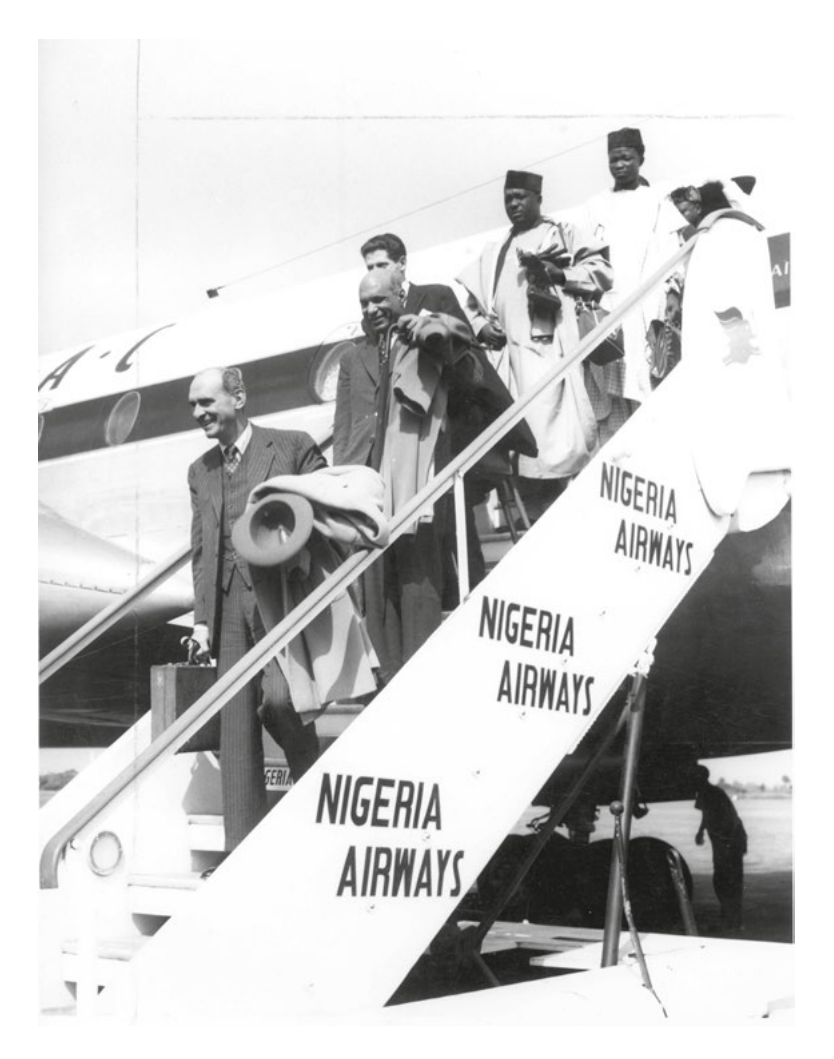
Figure 11: ILO Director-General David Morse arriving to the First African Regional Conference, Lagos, Nigeria, 1960.

international agencies to both launch large size programmes and get involved more directly in the developing countries' planning processes. Campaign-style programmes were also in line with new techniques tested by international agencies to reach out to a broader international public through cooperation with NGOs and academic partners. The WEP has to be seen in the context of a whole series of similar campaigns taking off from within the United Nations system during the 1960s and 1970s. Examples are the FAO's Freedom from Hunger Campaign