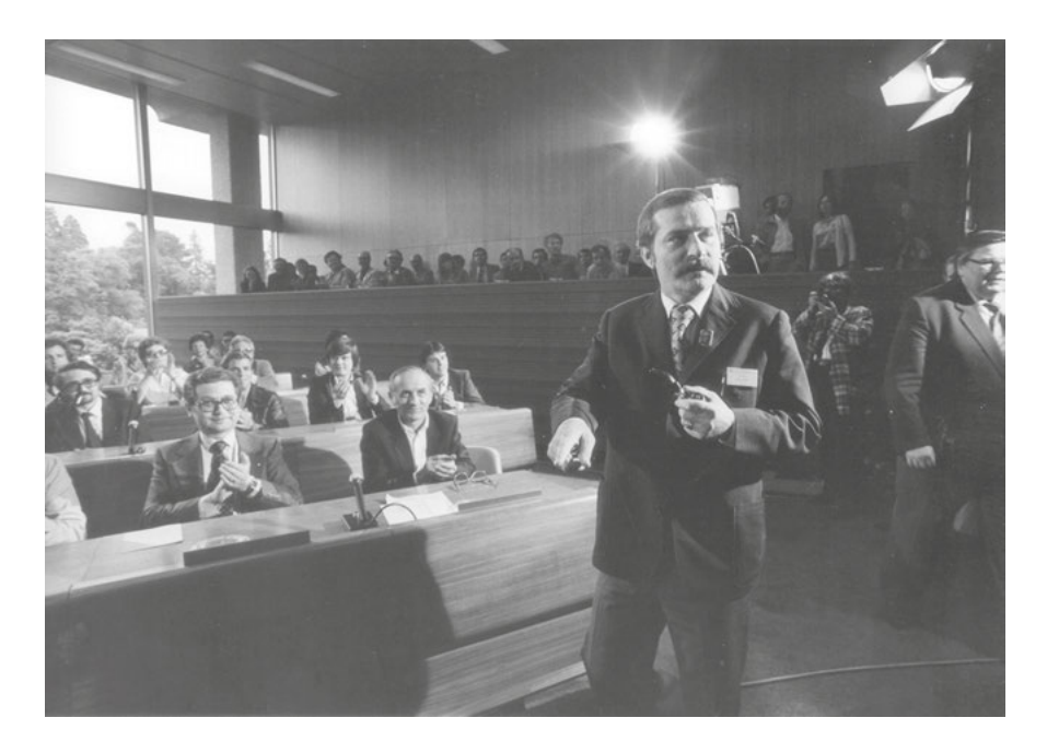
Figure 13: Lech Wałęsa at the 67th Session of the ILC, 1981.

(which, in return, received the backing for another resolution denouncing Israel). In March 1983, however, the Governing Body decided to establish a Commission of Inquiry, which found that there was no legal basis for the ban of Solidarnosc . The Polish government, supported by other socialist countries reacted with great indignation to the Commission's report which was submitted to the Governing Body in June 1984. In November of the same year, Poland submitted a notice announcing its intention to withdraw from the ILO within the regular two-year period. At this point, and despite continuing protests from the Workers' group, the ILO softened its approach towards Poland in order to keep the door for membership open. Martial law restrictions were progressively relaxed, and Solidarnosc could legally function again in 1986. Poland postponed its withdrawal and then actually never left.<sup>614</sup> By that time, the pace for changes in the region was set by the policy of perestroika under the new Soviet leader Mikhail Gorbachev. As one of the consequences of this change, the Workers' representatives of the formerly monolithic communist bloc were no longer obliged to vote in accordance with