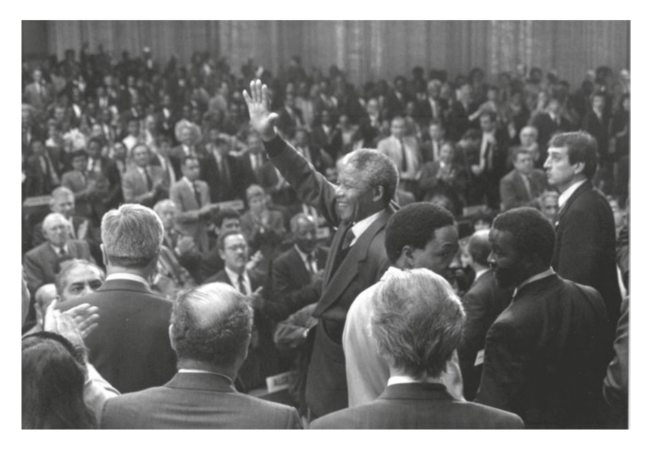
Figure 14: Nelson Mandela at the 77th Session of the ILC, 1990.

While unleashing an ever-increasing flow of goods and capital on an unprecedented scale and opening opportunities for businesses to expand, globalization has, at the same time, restricted the capacity of countries to control the economic forces working within their own national borders. As a consequence, governments – some more voluntarily than others – have abdicated some of their means to pursue social and employment goals, under the impression of presumably irrefutable demands of globalization. For the ILO, these developments and the debates accompanying them, spelled immediate dangers. Already during the late 1970s and 1980s some of the certainties - and indeed the foundations and premises on which the ILO's work had rested ever since the Second World War began to erode. If national governments and national trade union federations were losing part of their capacity to steer economic and social policies on the state level, the ILO would necessarily lose part of its influence, too.