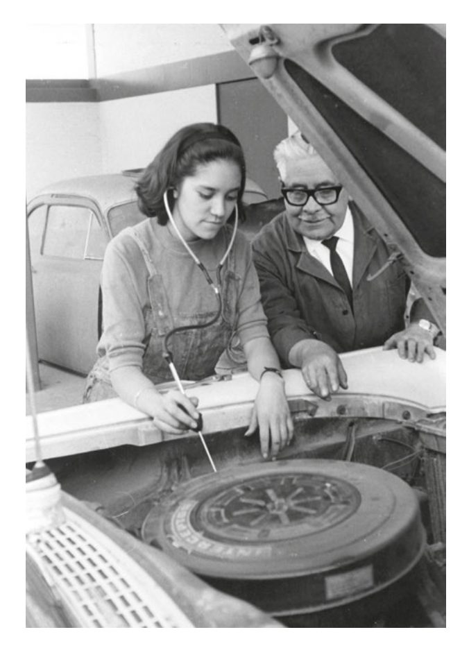
Figure 9: Training course in car mechanics, International Training Centre of the ILO, Turin, 1960s.

ception that "more scientific" approaches were necessary to gain credibility, both with the public and vis-à-vis other organizations carrying out similar functions. 433