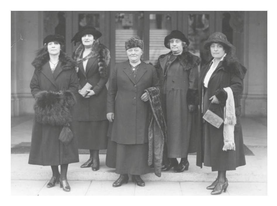
Figure 2: The Norwegian government delegate Betzy Kjelsberg (centre) with technical advisers. Kjelsberg was the first and only woman delegate with voting rights when she attended the third Session of the ILC in 1921.

The two Conventions that dealt specifically with women's employment were, for most part, an expression of the protective mainstream thinking. For legal equality feminists the Night Work (Women) Convention (No. 4) was the quintessential expression of the attempt to perpetuate a social order through ILO standard-setting which gave men priority in access to jobs and relegated women to the role of housewife and mother.<sup>152</sup> By contrast, the Maternity Protection Convention (No. 3) had wider support among women's organizations, because it also contained provisions for compulsory benefits that went beyond the merely protective frame. The protection of women workers during pregnancy and after childbirth has been the least controversial area of protective standard-setting for women, and it has