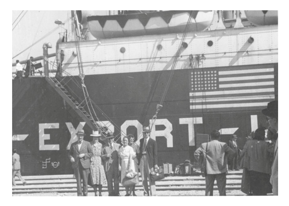
Figure 6: Group of ILO staff in Lisbon, waiting to board a ship to Canada, 1940.

ity had to be laid off. All in all, about 40 members of the ILO's staff travelled secretly through French and Spanish territories to Lisbon. From the Portuguese capital – where thousands of people fleeing persecution and war were desperately waiting for passage to a safe haven overseas – the group eventually boarded the steam liner Excambion , leaving Europe for an uncertain future.