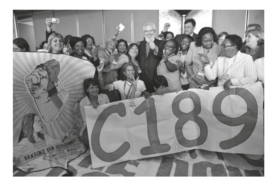
Figure 16: Representatives of domestic worker organizations celebrating the adoption of the Domestic Worker Convention (No. 189) with ILO Director-General Juan Somavía at the 2011 ILC.

ILO's long history of engagement with informality, which started in the 1970s with the World Employment Programme. ^{711}