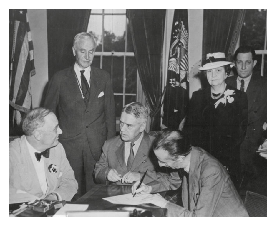
Figure 5: ILO Director-General Edward Phelan signing the Declaration of Philadelphia with Franklin D. Roosevelt, President of the United States, at the White House, 1944.

form upon which the ILO could secure its place in the post-war order, as the result of factors that its leadership and its most devoted supporters could only partly control.