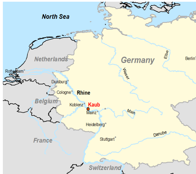
Figure 1: Map of the Rhine river and location of the gauging station Kaub.