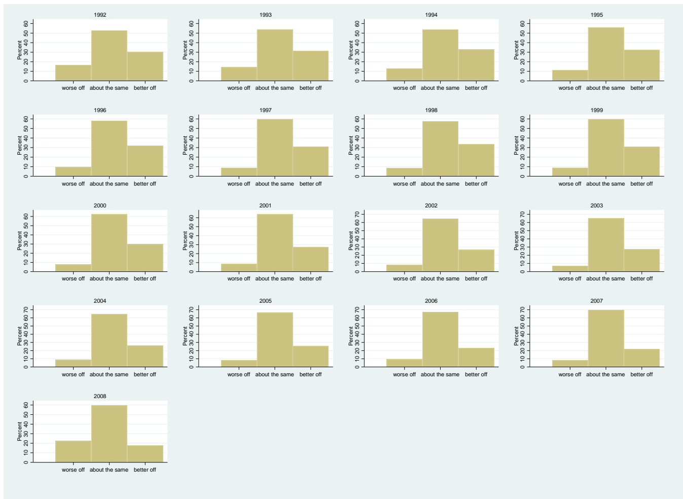
Figure A.1: Distribution of financial expectations – BHPS 1992 to 2008