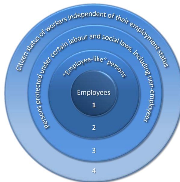
Fig. 2: Four-ring model of labour protection (illustration by the author)

Rings 1 to 4 include groups of persons who perform different kinds of work and receive different levels of protection under labour and social law. In the centre (Ring 1) are employees, surrounded in Ring 2 by “employee-like” individuals. Ring 3 encompasses people who have some connection to working life and enjoy protection unrelated to their status as an employee or “employee-like” person. In the outer ring (Ring 4), finally, are individuals independent of their relationship to work: “citizens”.