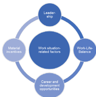
Illustration 3: Work situation-related factors (Own Illustration based on Rimser, 2014, S. 32)

In order to balance the different views of the generations, generation-specific tools, that can improve employee retention are shown below. The research results of the Hays Study and the Global Workforce Study as well as important results from relevant literature are included. (cf. Rump et al., 2012; Towers Watson, 2014) The tools are limited to work situation-related factors, because according to Westphal and Gmür the organisation-related factors have less influence on the feeling of commitment (cf. Westphal and Gmür, 2009, p. 207). Consequently, the following central fields of action arise: