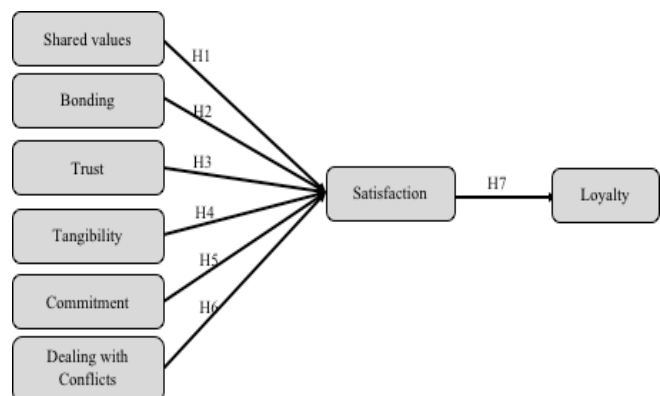
Figure 1. Research Framework

From Figure (1), the developed hypotheses could be stated as follows: Customer satisfaction is positively affected by shared values (H1), bonding (H2), trust (H3), tangibility (H4), commitment (H5), and handling conflicts (H6). Meanwhile, customer loyalty is positively influenced by customer satisfaction (H7).