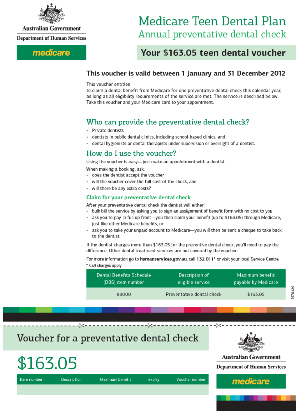
Appendix Figure A1: 2012 MTDP voucher