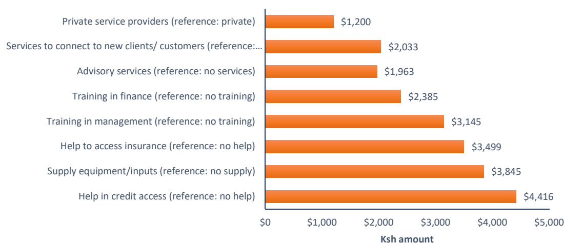
Figure 4: Services WTP

Training and advisory services come next, including those to help connect entrepreneurs to clients and new markets. However, there are significant differences in the valuation of different types of training. Training in business management, for instance, is valued 32 percent more than training in finance (3,145 Khs vs. 2,385 Khs). Training in financial services, in turn, is valued 20 percent more than advisory services. One might speculate that differences in preferences for different types of training/advisory services to be correlated with the education of the beneficiary, but as discussed below, we do not find statistically significant effects.