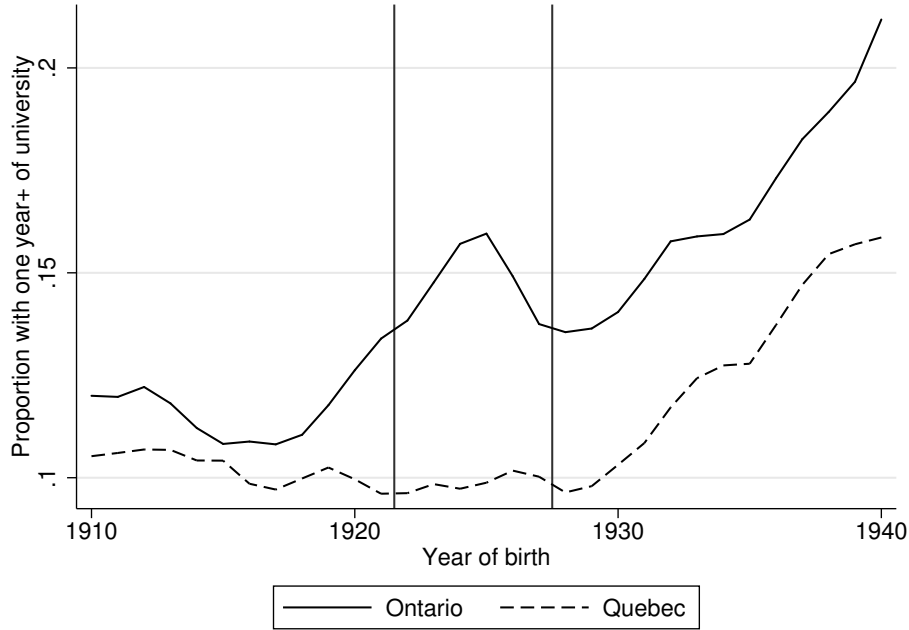
Figure 1: University attendance (%) by year of birth

appropriate control group for English-Canadians.