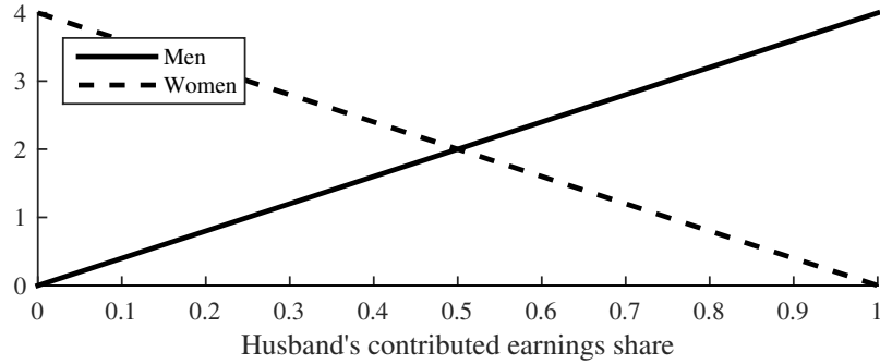
Figure 1: Model-predicted elasticity of labor supply to individual firms as a function of the husband’s contributed share to household earnings.

Notes: Example for \gamma_f = \gamma_m = 0.4 and V = 10 .