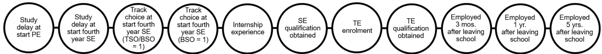
Figure 2. Schematic overview econometric model.

Note. The following abbreviations are used: PE (primary education), SE (secondary education), TE (tertiary education), mos. (months), yr. (year), and yrs. (years).