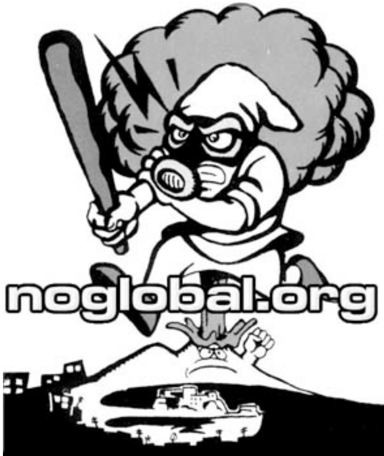
Naples Global Forum Symbol