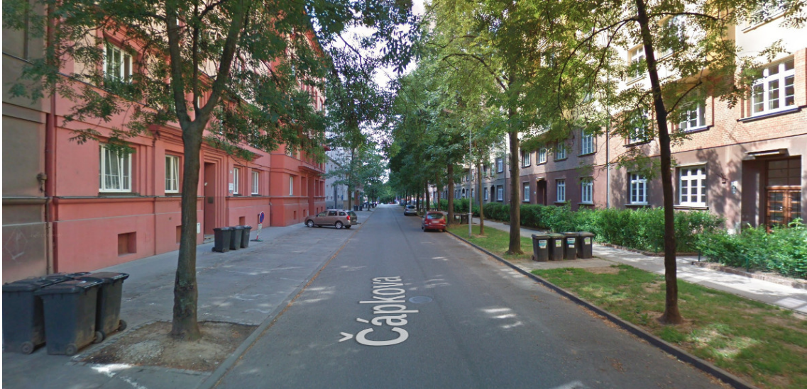
Figure 2: Privatized (on the left) and restituted (on the right) apartment buildings in Čápkova street, Brno.

privatize. Finally, privatizers were free to sell their apartments. However, their ability to do so was probably quite limited as Czech banks did not provide mortgages for coop-owned housing units, limiting the demand.