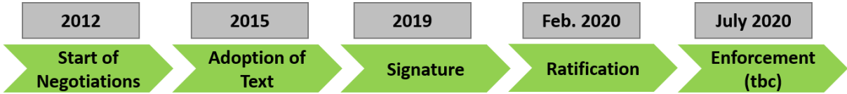
Chart: EVFTA Timeline

While the EVFTA has far greater economic importance for Vietnam than for the EU, it is politically significant for both partners. Especially the EU has also always emphasised the positive impact on human rights and labour standards expected after entry into force of the agreement although it failed to conduct a human rights impact assessment before the start of the negotiations. The annual Human Rights Dialogue between Vietnam and the European Union in line with the Partnership and Cooperation Agreement was used to recall the need to respect and promote human rights and labour standards. While the EU consulted civil society organisations on this dialogue in either Brussels or Hanoi, there is no news about such a dialogue between the Government of Vietnam and Vietnamese civil society before these consultations. In the next subchapter we will analyse what this could mean for the civil society mechanism in the EVFTA.