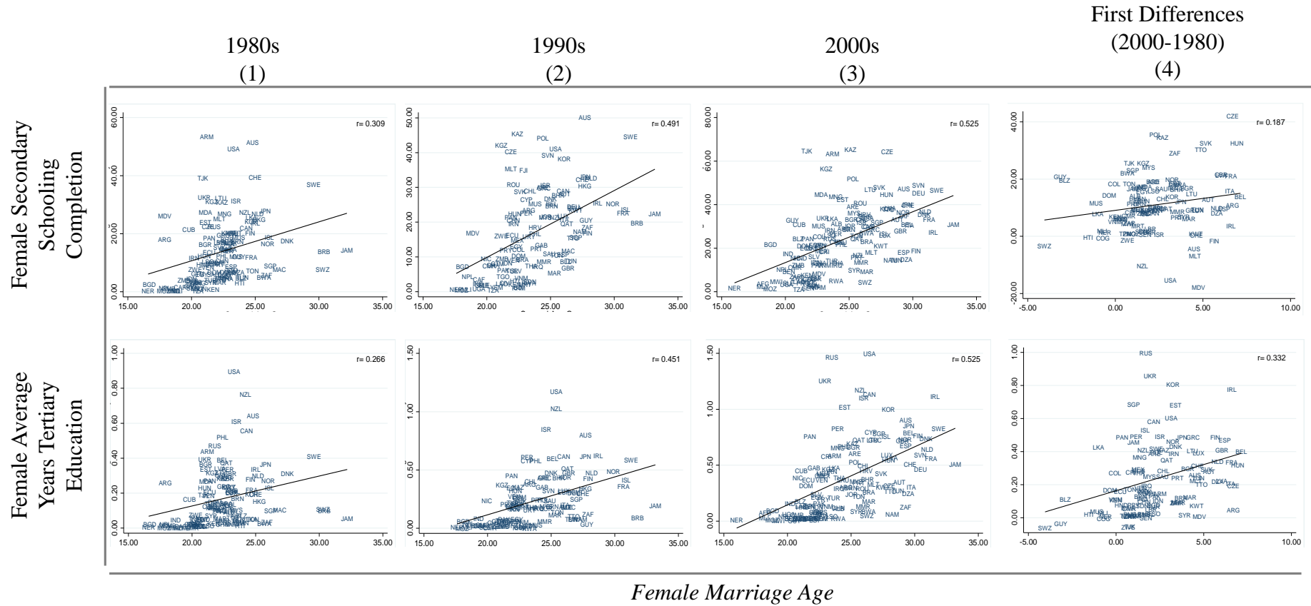
Figure 2: Scatter plots of Female Marriage Age against education variables