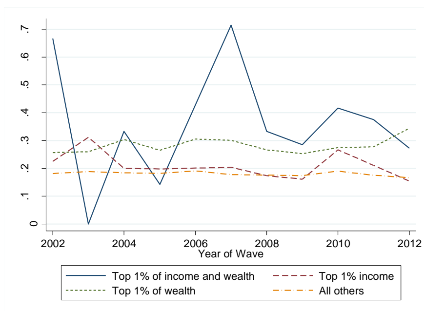
Figure 2: A 2002 –2012 comparison of the percentage of volunteers from the top 1 per cent of earners, the wealthiest top 1 per cent and the general population

As time progresses, however, the volunteering rate for both the wealthy and the high-income earners is highly volatile, possibly because of a low number of observations ( N = 90 ). This rate plummeted to its nadir in 2003 and then peaked at 0.7 per cent in 2007, nearly three times higher than for all other groups. Not surprisingly, since the wealth-destroying shock of the global financial crisis (GFC) in late 2007–2008, the level of volunteering by wealthy individuals with the highest income has reverted to the mean of all other groups. Perhaps the tougher economic conditions post GFC (a 21 per cent decline in average wealth in our sample between 2006 and 2010) motivated the top 1 per cent to reallocate their time to rebuilding wealth and restoring their high incomes.